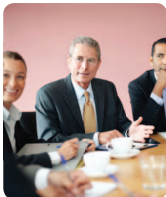
Reputation risk as paradigm for fundamentally intractable risks.